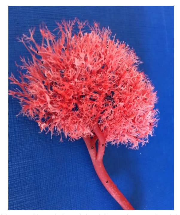
Figure 3. Ventral view of the right renal artery. A = right renal artery, V = right ventral branch, D = right dorsal branch, I= interlobar artery, C = arcuate artery, L = interlobular artery