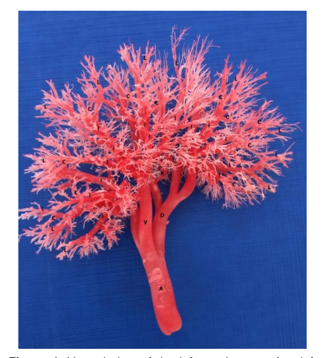
Figure 4. Ventral view of the left renal artery. A = left renal artery, V = left ventral branch, D = left dorsal branch, K = one interlobar artery, the originated from ventral branch nourished dorsal surface of the ren, I= interlobar artery, C = arcuate artery, L = interlobular artery