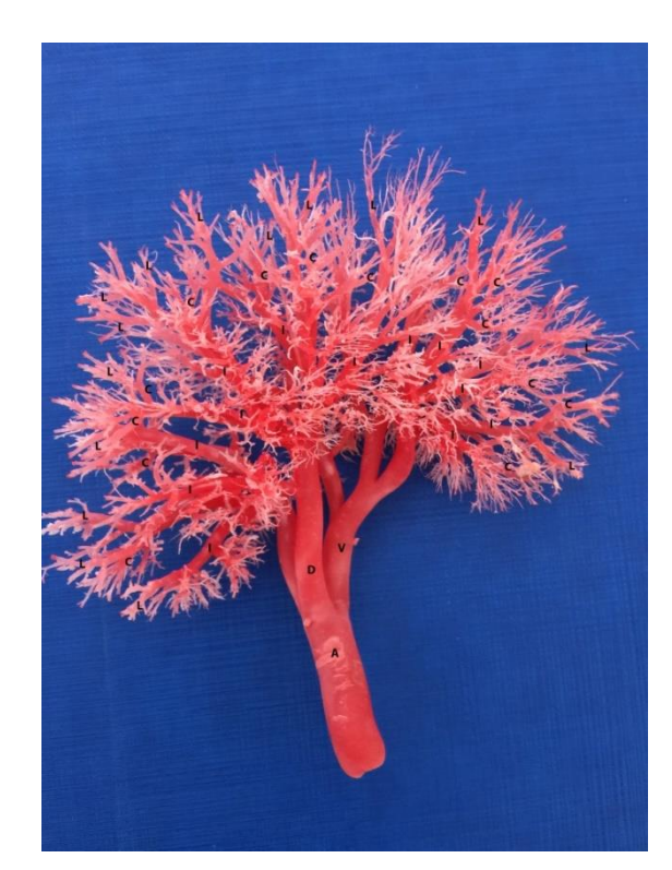
Figure 2. Dorsal view of the left renal artery. A = left renal artery, D = left dorsal branch, V = left ventral branch, I= interlobar artery, C = arcuate artery, L = interlobular artery