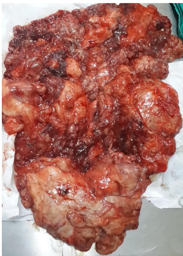
Figure 4. Removed tumoral mass

When it was decided for the second operation, low dosage anesthesia was used because of dog's age. In this operation wide and deep surgery was made. The extracted mass was weighed 3020 gr. During the operation, it was seen that there were milimetric protrusions covering the under the skin in one area. This skin part was removed and the wound line was closed with sutures. Parenteral antibiotic and nonsteroidal anti-inflammatory treatment was recommended for 5 days after the operation and the patient was discharged. The patient owner reported that the patient died 8 hours after the second operation. Because the animal owner didn't accept the necropsy, the reason of the death and metastasis could not be understood exactly.