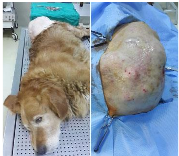
Figure 3. Recurrence of the fibrosarcoma

After general anesthesia of the patient, the skin was excised to reach the mass. Tumor mass was gelatinous and semi-fluid. All of the mass was removed from 2 separate incision lines and the skin was closed with sutures. The mass of the tumor was approximately 1570 g. and the size was 20x15x7 cm. One week after the operation, the chemotherapy application was started with using vincristine sulphate. Intravenous administration of vincristine sulphate (Vincristine, DBL®, Mayne Pharma PtyLtd, Melbourne, Australia) 0.025 mg/kg (0.5-0.7 mg/m 2 , maximum 1 mg) in 500 mL isotonic serum with slow infusion at 3 times per week, but recurrence started in the same area and bilateral region about two weeks after the last chemotherapy. Approximately 4 weeks after the last chemotherapy, tumoral mass size was measured 31x21x9 cm (Figure 3 and 4).