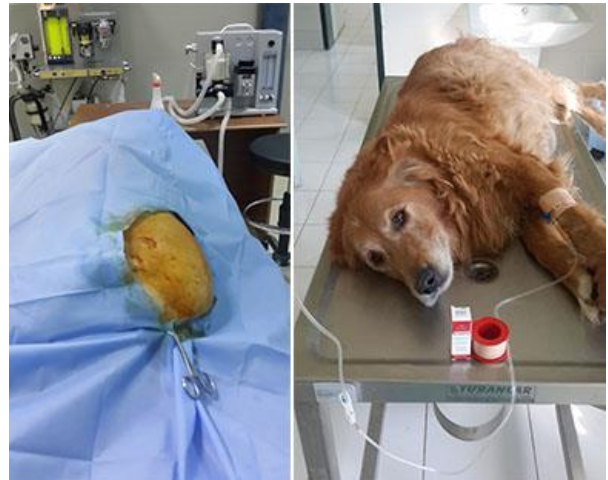
Figure 2. First operation and chemotherapy application

Surgical Procedure: The patient owner was informed about the dog's old age and the risk of recurrence of this malignant tumor. Preparations were made for the operation with the approval of the patient owner (Figure 2).