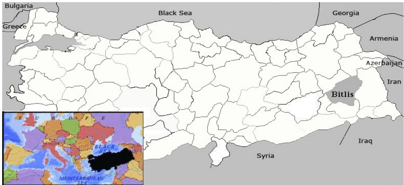
Figure 1. Location map of the province of Bitlis