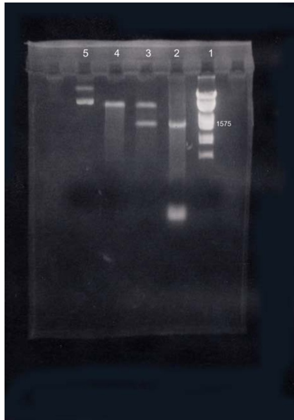
Figure 2. Demonstration of recombinant plasmid pin3-NP.

By cutting the recombinant pin3-NP plasmid DNA with HindIII and KpnI, a piece of 1575 nucleotides was obtained (Figure 2, lane 3). Furthermore, following the cutting with the XbaI enzyme which does not recognize any site on the prokaryotic expression vector, it was observed that the recombinant plasmid was opened in a linear structure as expected (Figure 2, line 4). The primers specific to the NP gene were used and the presence of the NP gene in the recombinant plasmid was shown. Accordingly, an amplification product of approximately 1575 base pair long was shown in 1.5% agarose gel stained with ethidium bromide (Figure 2, lane 2).